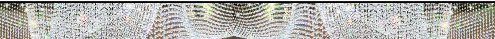
This and opposite page, from left: PeakFine’s crystal chandelier; the Penthouse Suite’s bathroom; and the spa’s steam and sauna area.

The rooms and the spa also take advantage of the incredible views. In the guestroom, other than a trademarked “power wall” made of ash that separates the wet and dry areas and holds the fireplace, TV, and mini fridge, a wall-to-wall window offers views from the open shower and bedroom. And in the spa, lounge areas