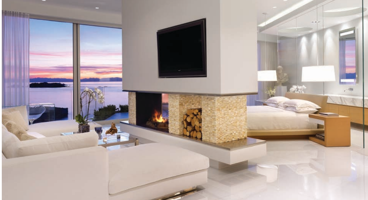
Clockwise from left Ocean Front Residence, by Mitchell Freedland Design; Vancouver Convention Centre West, by MCM Interiors; Terminal City, by SSDG Interiors; Homburg Penthouse, by Ingenium Design Group.