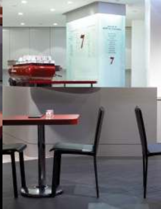
Leather Italian chairs, curving booths, and splashes of vibrant red give visitors to Caffè Sette a different experience.